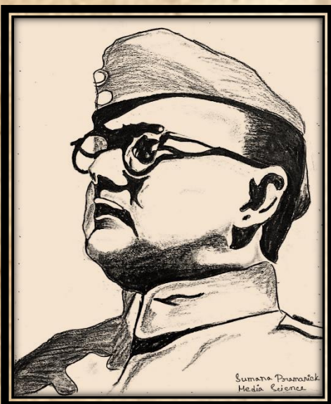
-Painted By Sumana Pramanick B.Sc. Media Science