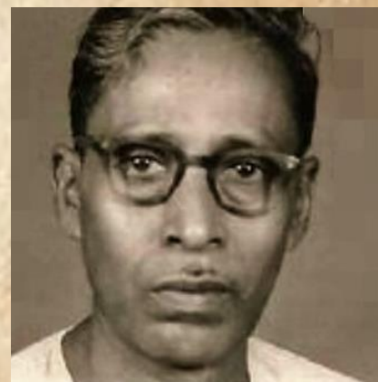
Ganga Kishore Bhattacharya The First Bengali Publisher