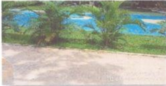
Figure 14 Campus Grass