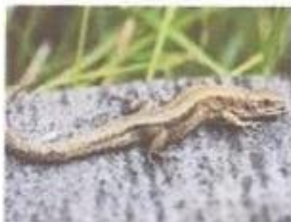
Figure 12: Images of Reptiles

Principal Swami Vivekananda Institute of Modern Science Sonarpur Stn. Road, Karbala P.S.-Narendrapur, Kol-103