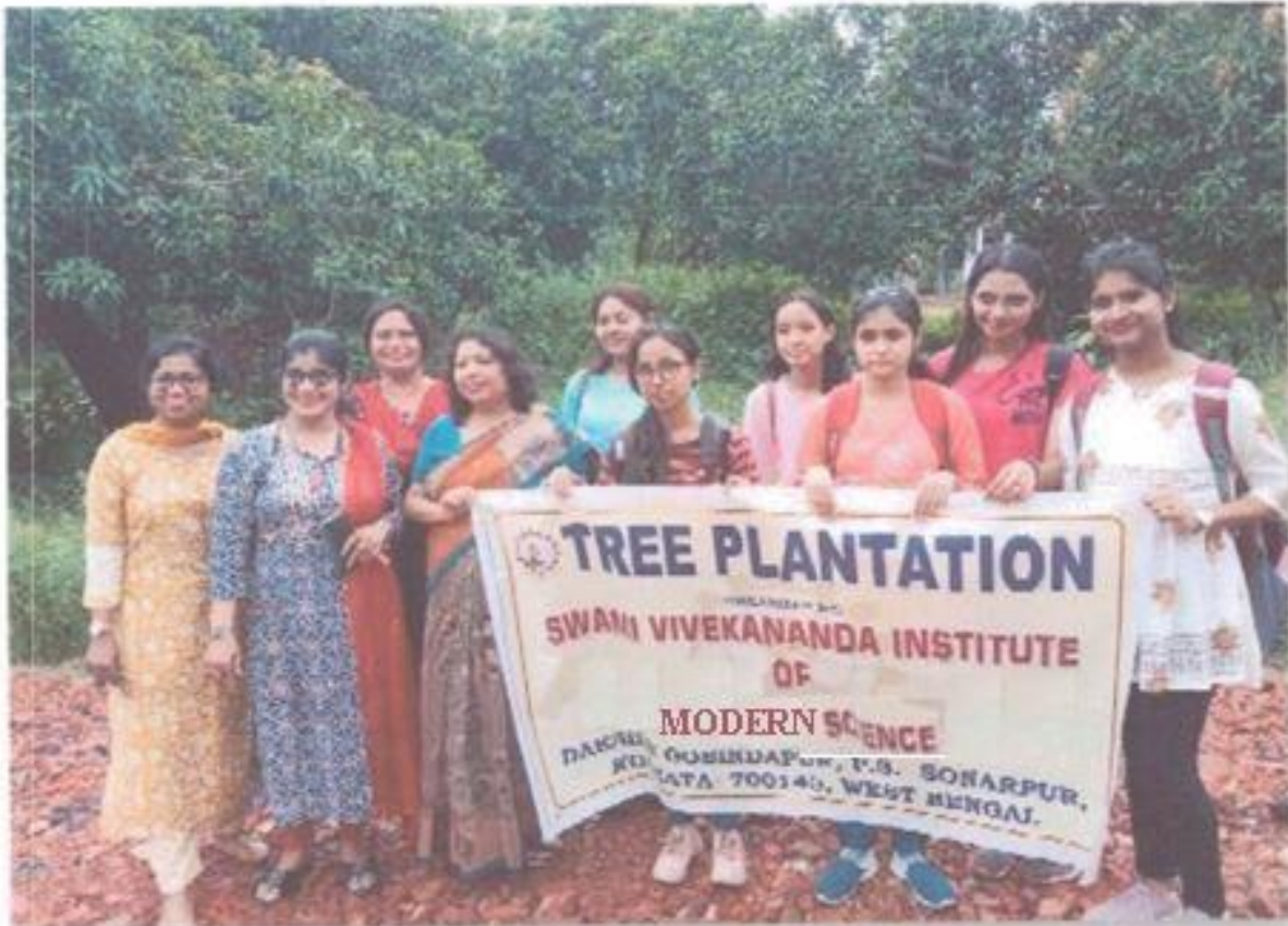
Figure 17. Plantation Programme