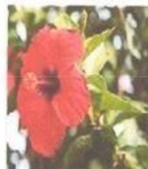
Figure 16: Flower

Principal Swami Vivekananda Institute of Modern Science Sonarpur Stn. Road, Karbala P.S. Narendrapur, Kol-103