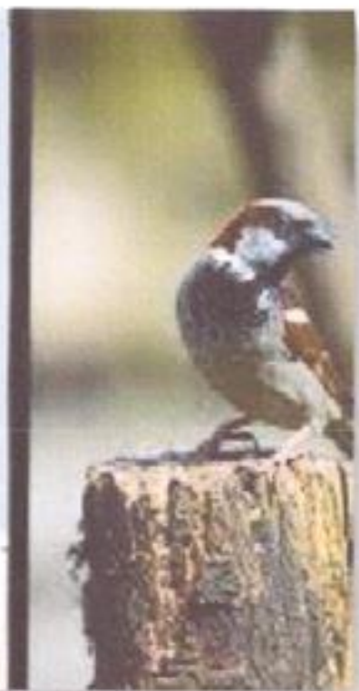
Figure 13: Local Birds

Principal Swami Vivekananda Institute of Modern Science Sonarpur Stn. Road, Karbala P.S.-Narendrapur, Kol-103