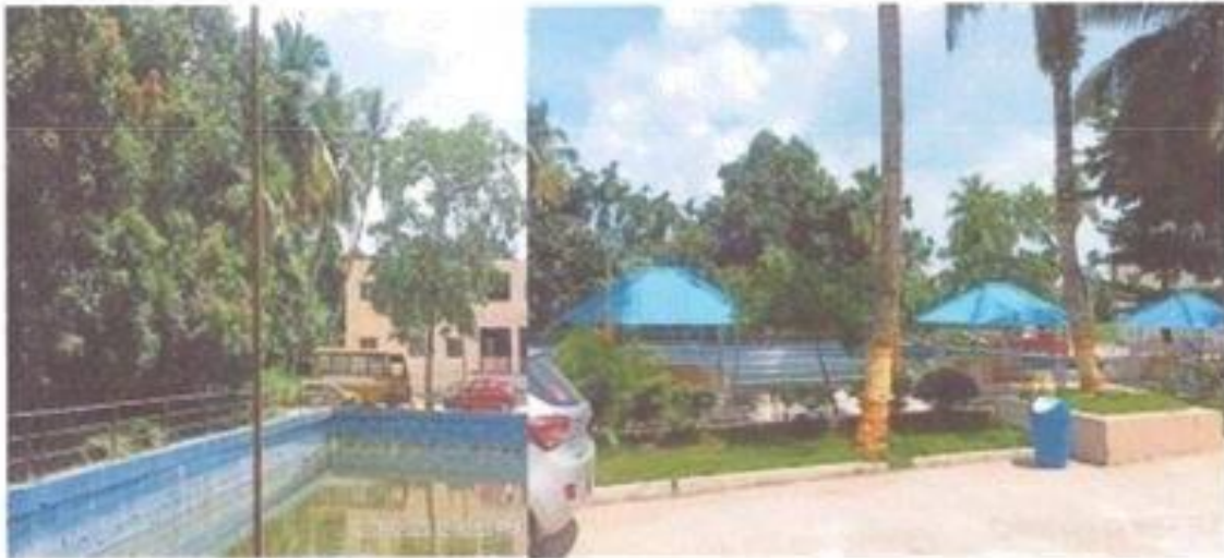
Figure 10 : Major Plant diversity of the institute

Principal Swami Vivekananda Institute of Modern Science Sonarpur Stn. Road, Karbala P.S. Narendrapur, Kol-103