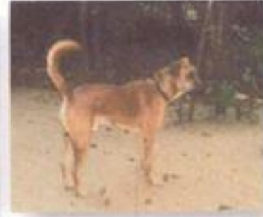
Figure 15: Mammals

Principal Swami Vivekananda Institute of Modern Science Sonarpur Stn. Road, Karbala P.S. Narendrapur, Kol-103