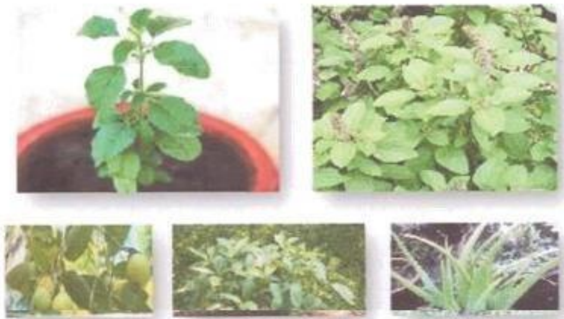
Figure 11 : Medicinal Plant of the institute