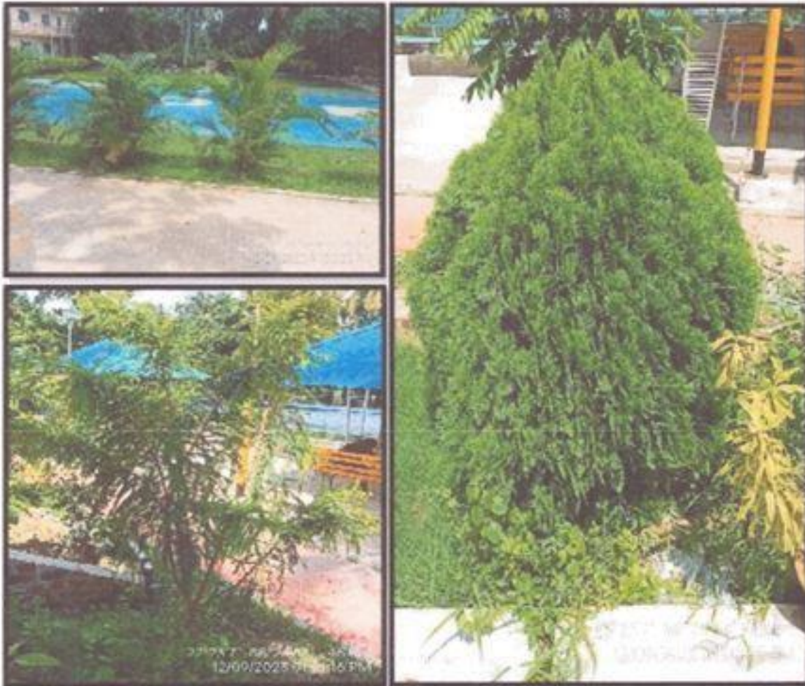
Figure 9 : Plant diversity of institute

Swami Vivekananda Institute of Modern Science premises having about 3.02 acres of land have unique plant diversities. These include flowering plants, leafy trees, medicinal herbs and innumerable wild bushes. There are valuable trees like Bamboo, Jackfruit, banana, Mango, Guava etc.