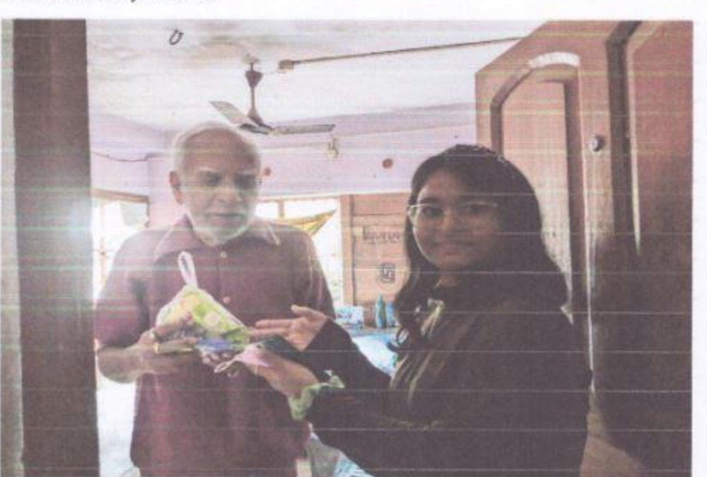
Food Distribution at Old age home